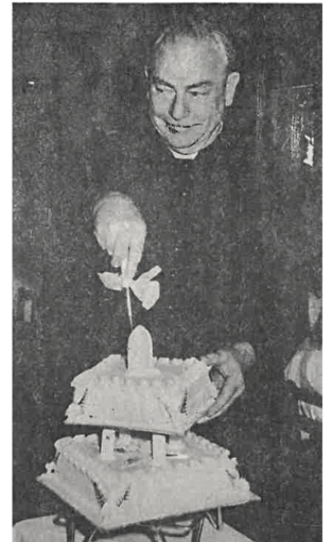
Central Coast Newspapers Wed, Jan 16, 1974